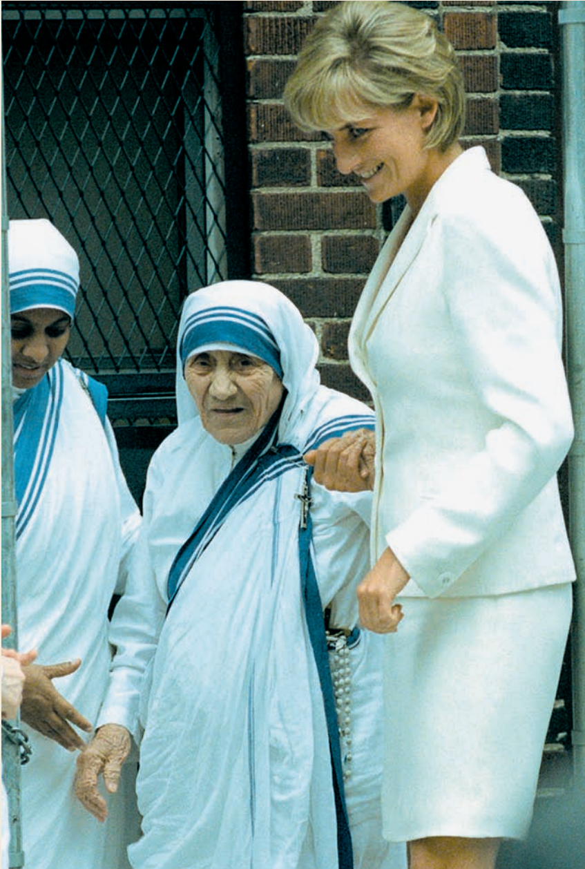
Mother Teresa walks with Princess Diana after receiving a visit from her on June 18, 1997, in New York. The two women first met in 1992, when Princess Diana made a special stop to meet Mother Teresa in the Roman hospital where she was recuperating following a bout of illness.