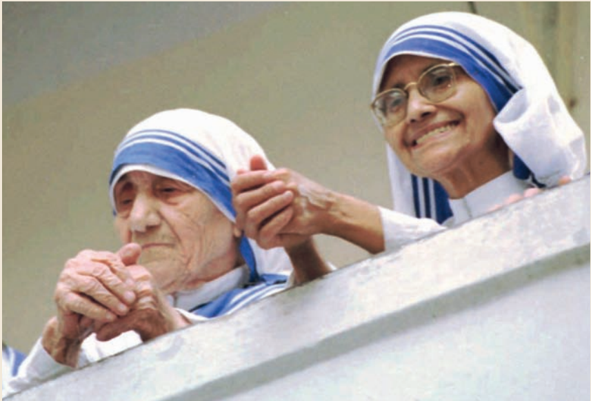
Sister Nirmala (right), one of the earliest members of the Missionaries of Charity, was elected to be Mother Teresa’s successor in 1997. The two nuns are shown in a photograph from March 1997, shortly after Sister Nirmala was declared the new Superior General.

ishing evening prayers, she complained of a searing pain in her spine. “I cannot breathe,” she reportedly told her physician. 61 Minutes later, Mother Teresa’s heart stopped beating.