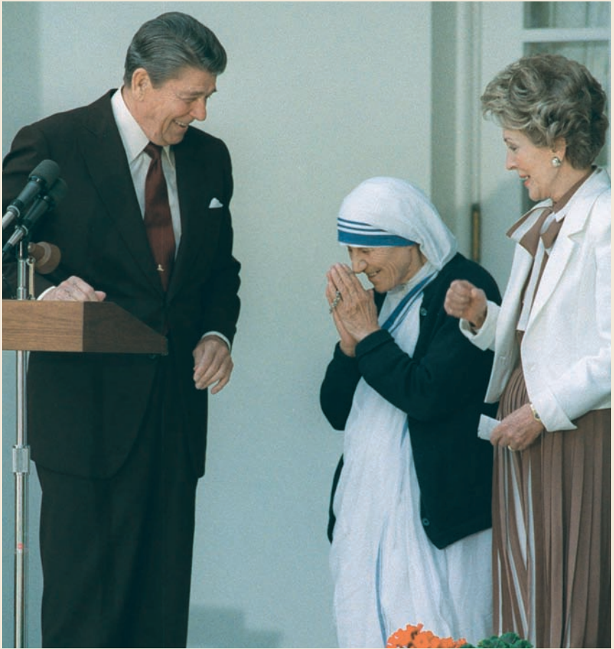
Mother Teresa bows toward President Ronald Reagan during the ceremony in which he presented her with the Medal of Freedom on June 21, 1985.

she believed, because far too many AIDS patients were abandoned, even by their own families, and left to face what was usually an agonizingly painful death alone. Named “Gift of Love,” the first Missionaries of Charity hospice was located in one of the areas hardest struck by the AIDS epidemic in America: New York City. “We are not here to sit in judgment on these people, to decide blame or guilt,” Mother Teresa explained at the opening