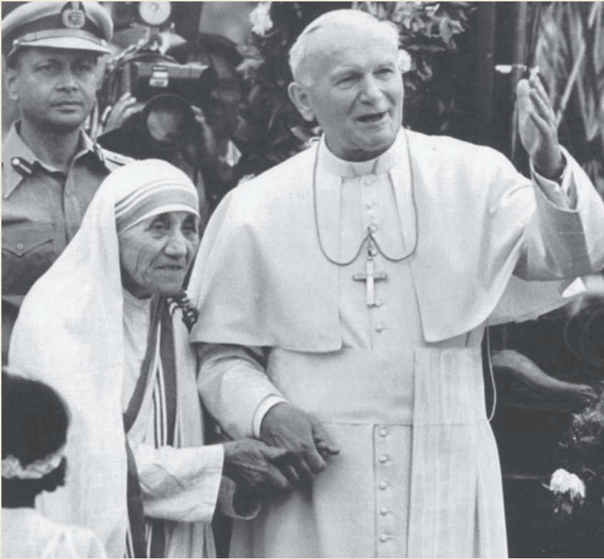
Pope John Paul II is shown here with Mother Teresa, during an official visit to Calcutta in 1986. The pope toured Nirmal Hriday with Mother Teresa, on a day that the nun later described as the happiest of her life.

early and mid-1990s, the Missionaries of Charity and its founder were plagued by controversy.