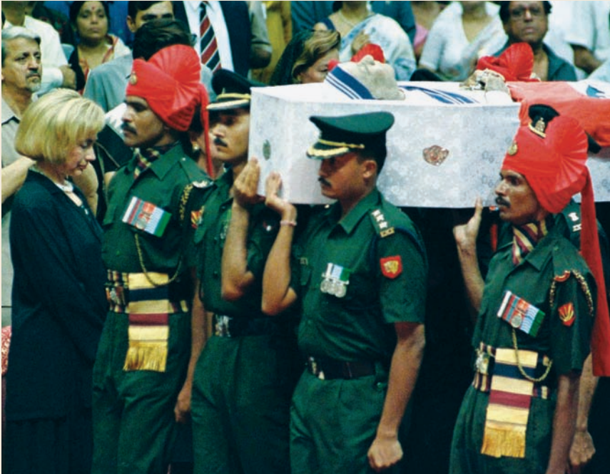
Hilary Rodham Clinton (left), at the time the First Lady of the United States, bows her head as Indian soldiers carry Mother Teresa's casket into the Netaji Indoor Stadium in Calcutta.

surprising that someone who had no formal involvement in politics or diplomacy should have been chosen for this distinguished award. The Norwegian Nobel committee, however, has a long tradition of honoring those who strive to overcome poverty, hunger, and social injustice in the world, all of which they view as grave threats to peace, both within and among nations.