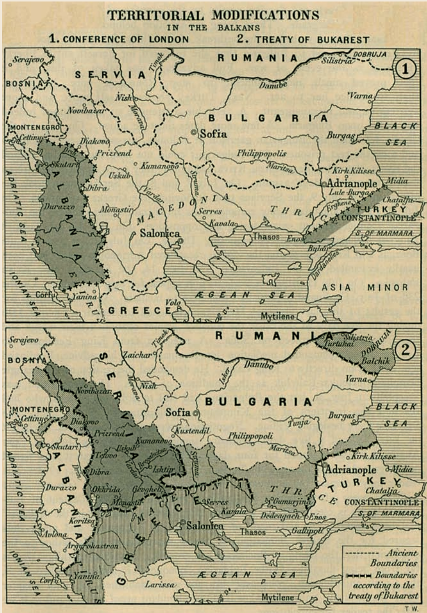
This map shows the boundaries of the Balkan nations as they appeared before World War I. Mother Teresa’s birthplace, Skopje, is labeled as “Uskub,” the Turkish name for the Macedonian town.