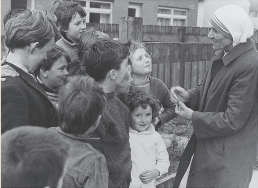
Mother Teresa is shown here during a visit to Belfast, Ireland, in 1971. The Sisters of Loreto, the first order to which Mother Teresa belonged, is based in Ireland.

recipient of a series of prestigious international awards. In 1971, Pope Paul VI presented her with the Pope John XXIII Peace Prize, which honored those who worked to promote peace, love, justice, and truth among individuals or nations. Three other major awards followed that same year: the Good Samaritan Award of the National Catholic Development Conference, the John F. Kennedy International Award, and an honorary degree from the Catholic University of America. In 1972, the Indian government honored her with the Nehru Award for International Understanding, and in 1973 Prince Philip of England awarded her the Templeton Award for Progress in Religion. The recognition and cash rewards these various awards entailed allowed Mother Teresa to open additional houses, including the Nirmala Kennedy Center in Calcutta for mentally or physically handicapped children.