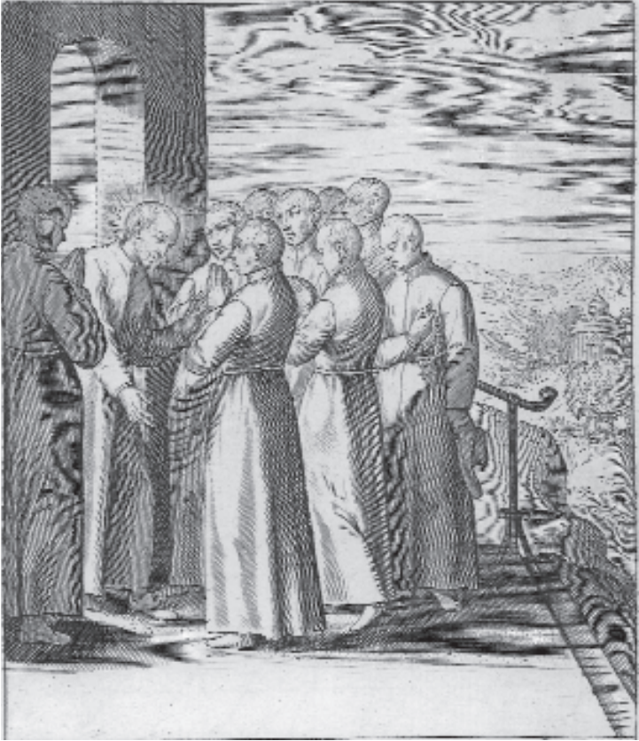
Vita beati P. Ignatii Loiolae Societatis Iesu fundatoris. (The Life of St. Ignatius Loyola, Founder of the Society of Jesus) Rome, 1609 In Paris, Ignatius wins new companions