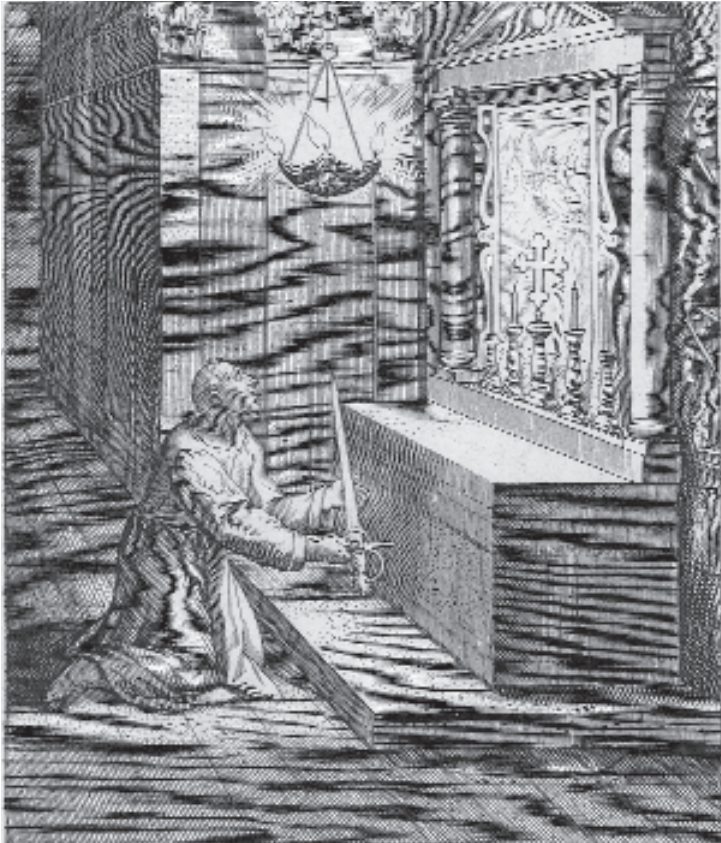
Vita beati P. Ignatii Loiolae Societatis Iesu fundatoris. (The Life of St. Ignatius Loyola, Founder of the Society of Jesus) Rome, 1609 Ignatius offers his sword to the Madonna of Montserrat