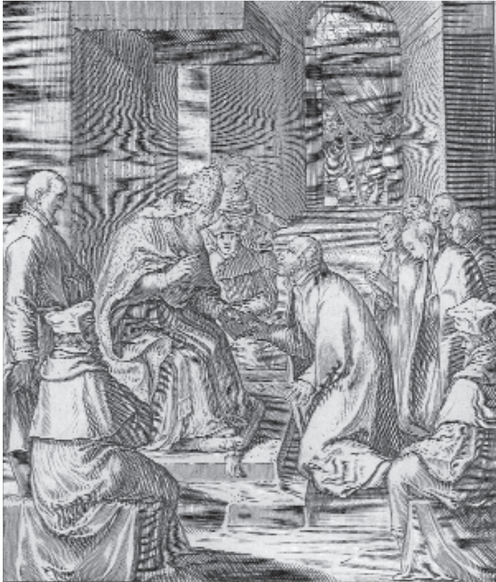
Vita beati P. Ignatii Loiolae Societatis Iesu fundatoris. (The Life of St. Ignatius Loyola, Founder of the Society of Jesus) Rome, 1609 Ignatius receives from Pope Paul III papal approval of the Order