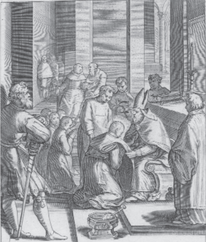
Vita beati P. Ignatii Loiolae Societatis Iesu fundatoris. (The Life of St. Ignatius Loyola, Founder of the Society of Jesus) Rome, 1609 In Venice, Ignatius, with his companions, is ordained a priest