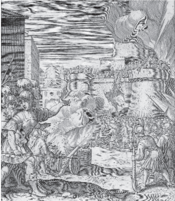
Vita beati P. Ignatii Loiolae Societatis Iesu fundatoris. (The Life of St. Ignatius Loyola, Founder of the Society of Jesus) Rome, 1609 Ignatius is severely wounded in the battle of Pamplona