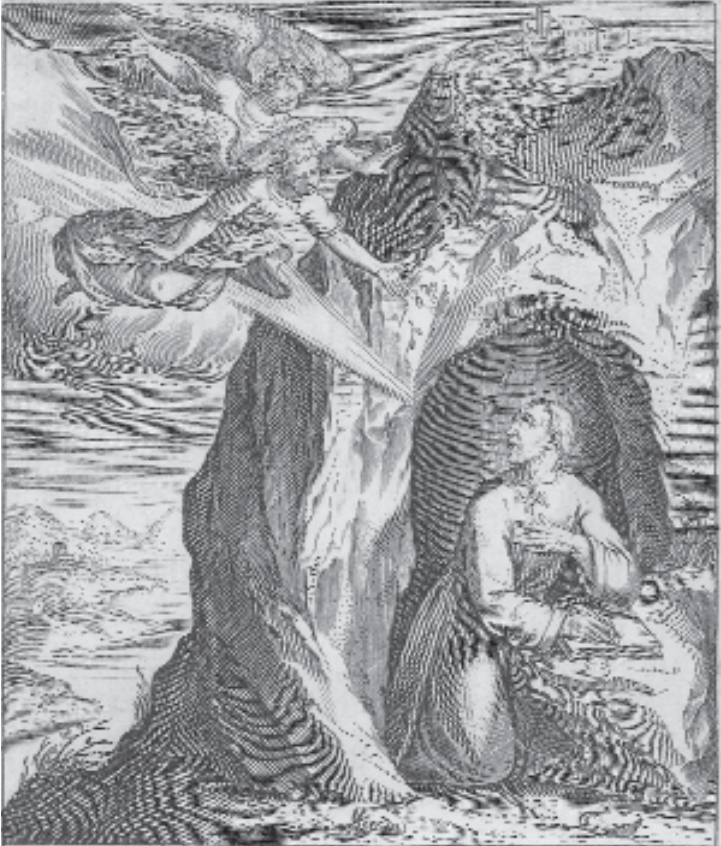
Vita beati P. Ignatii Loiolae Societatis Iesu fundatoris. (The Life of St. Ignatius Loyola, Founder of the Society of Jesus) Rome, 1609 In Manresa, Ignatius begins to write down his Spiritual Exercises