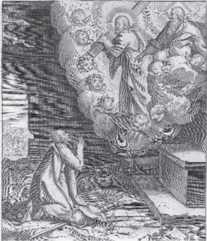
Vita beati P. Ignatii Loiolae Societatis Iesu fundatoris. (The Life of St. Ignatius Loyola, Founder of the Society of Jesus) Rome, 1609

At La Storta, outside Rome, Ignatius has a vision of God the Father and of Christ