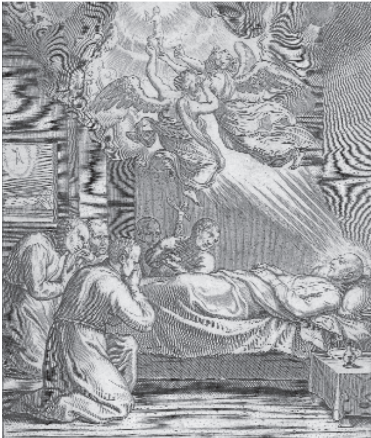
Vita beati P. Ignatii Loiolae Societatis Iesu fundatoris. (The Life of St. Ignatius Loyola, Founder of the Society of Jesus) Rome, 1609 Death of Ignatius