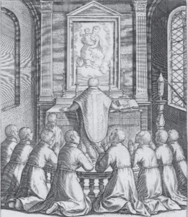
Vita beati P. Ignatii Loiolae Societatis Iesu fundatoris. (The Life of St. Ignatius Loyola, Founder of the Society of Jesus) Rome, 1609 Ignatius and his companions make their vows in Montmartre