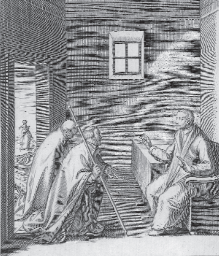
Vita beati P. Ignatii Loiolae Societatis Iesu fundatoris. (The Life of St. Ignatius Loyola, Founder of the Society of Jesus) Rome, 1609 Ignatius sends Francis Xavier to India as a missionary